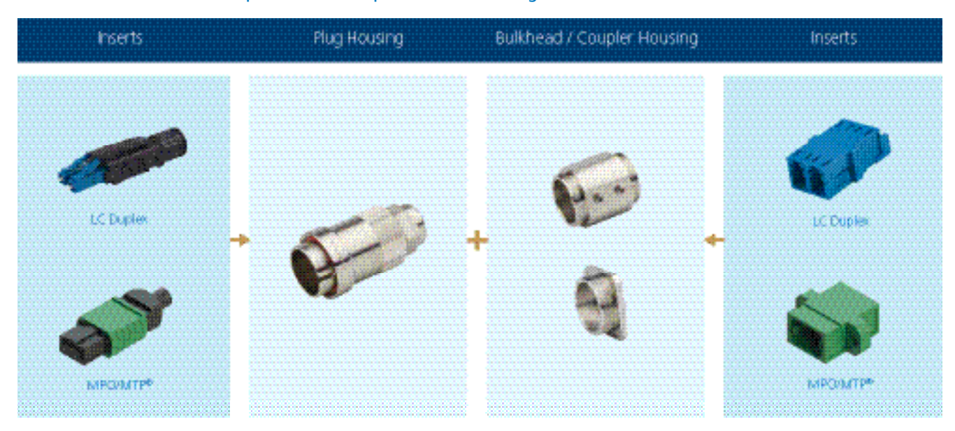
Overview TOC Series Fiber Optic with nickel-plated brass housing